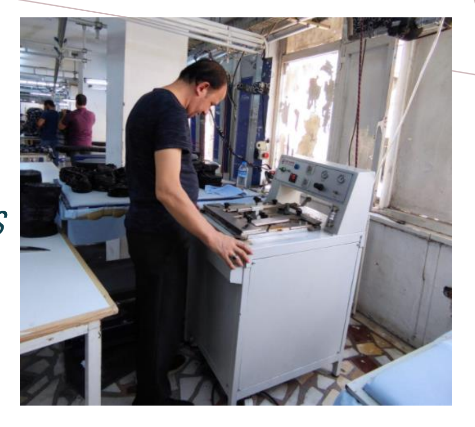
PATTERN MACHINE ASSYST BULLMER CARE CAD CUTTER MANUAL - 2PCS (TR) SNAP BUTTON - 4PCS (JEMA) POCKET IRONING - 1 PCS (AKIN)